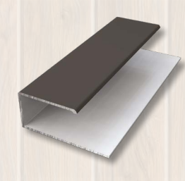
J Trim FCA3023N1AP Aged Padauk RAL No. 7022M

Colour matched aluminium finishing trims with RAL numbers.