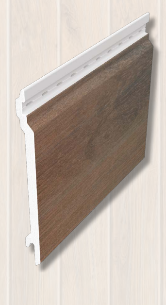
Aluminium Trim Range

Colour matched aluminium finishing trims with RAL numbers.